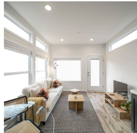
Images may show optional upgrades not included in the base model. Please refer to your sales representative.